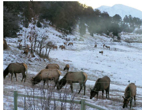
Elk herd right outside our window.